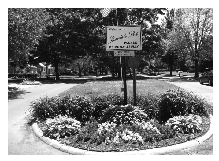
Great job on the island, Warwick (Midland to Keeler).

If your island needs a tune up, contact some of your neighbors to put together a simple, inexpensive plan. Tina Castleberry, a master gardener who lives on Faust, is the owner of the new garden store in the neighborhood called The Garden Bug. "A simple way to spruce up your island is to weed and add mulch which improves the curb appearance," said Castleberry. "Along